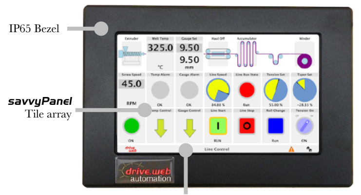
Status Bar with drive.web button, page name, Alarm indicator and button, and Home and / or Systems button.