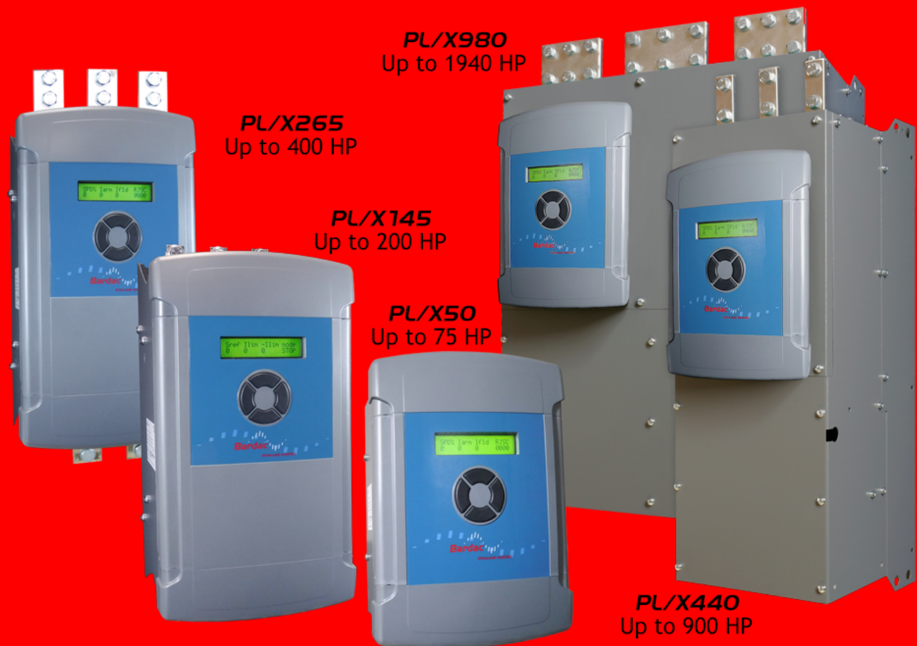
PL/X980 Up to 1940 HP